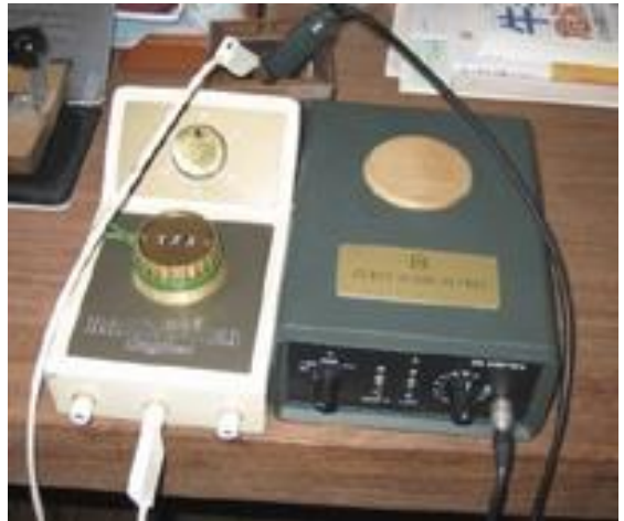
Rayometer (Left) with Zero Search Device (Right)

infections (e.g. Epstein Barr Virus, Cytomegalovirus, Coxsackie Virus, etc.), and that 9. I was being affected by geopathic stress and electromagnetic radiation.