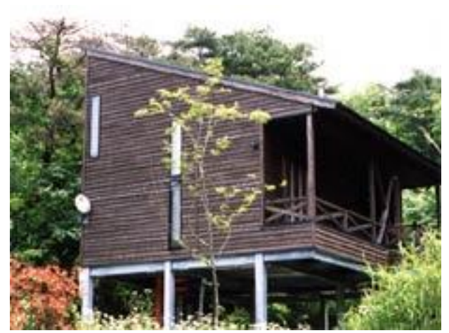
Our Log House for Four Months in the small village of Sugiyama, Saga Prefecture, Japan.